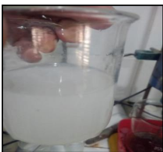
Aqueous emulsion of prepared fat liquor