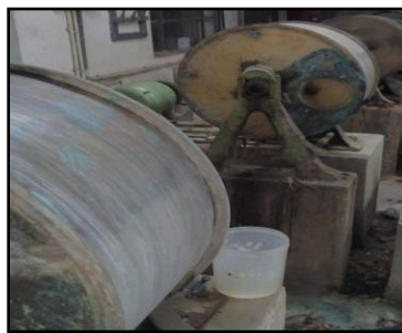
Leather Processing of Wet Blue with fatliquor "Hempfat"