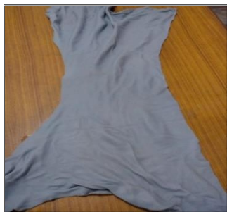
Wet Blue Leather

A fatliquor prepared from hemp seed oil has been applied on wet blue and showed excellent properties of Fatliquor comparable to a commercial one. It was found to produce finished natural leather with excellent softness, fullness, hundred percent fixation and lubrication, only in low uptake during leather processing at Leather Research Center, (LRC) PCSIR, Karachi. Fatliquored leather is found to possess a good quality finish with excellent properties.